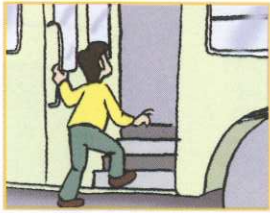
get on the bus