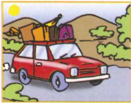
go on a trip