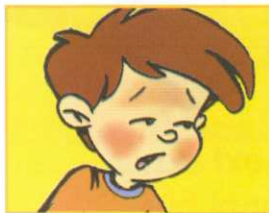
a red face