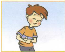
He doesn't feel well.